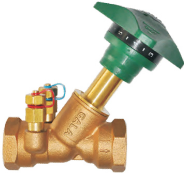
1209-BT&BTM BRONZE FIXED ORIFICE