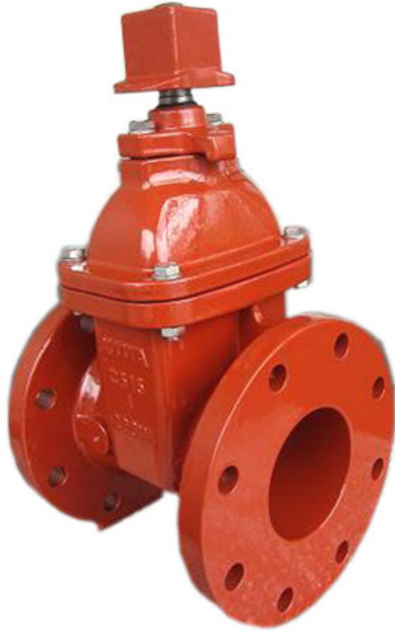
AWWA/ANSI 250Psi Non-Rising Stem Resilient Seated Gate Valve, Flanged connection